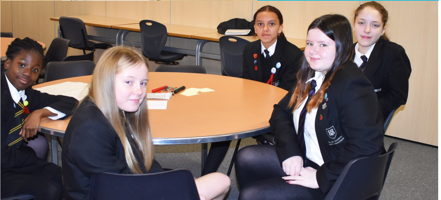
Photo caption: Peer mentor training with other schools across Manchester. During the event, they spoke to attendees about the role they play in the Academy.