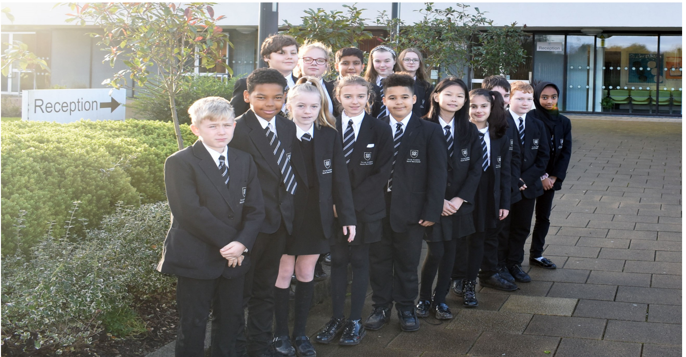
Photo caption: Year 7 Student Council