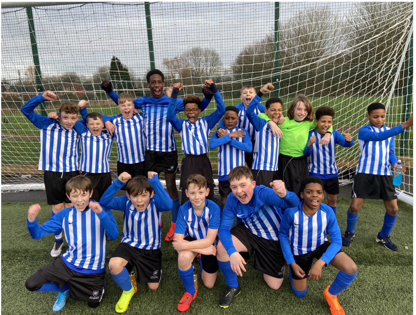
Photo caption: Year 7 Football Team reach the Manchester School Cup Final