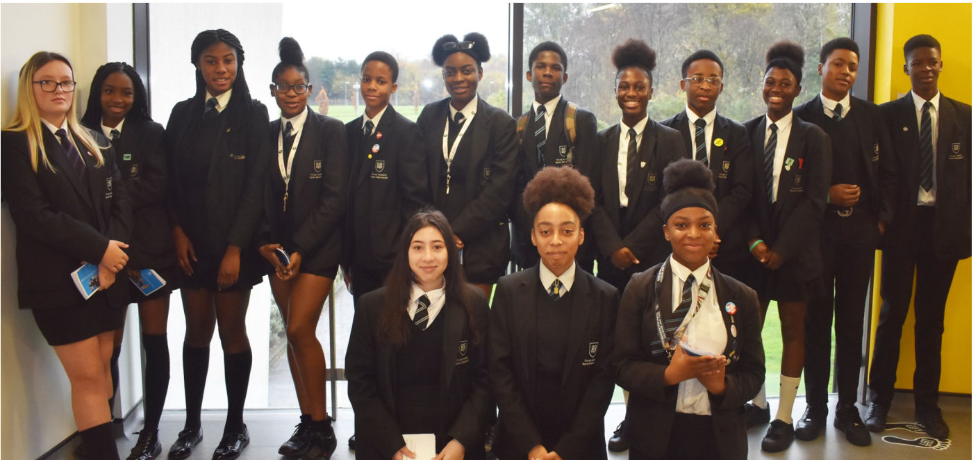
Photo caption: Anti-Bullying Ambassadors before their inspiring talk to pupils in assembly. They pledged to stand up to bullying and asked for everyone's support.