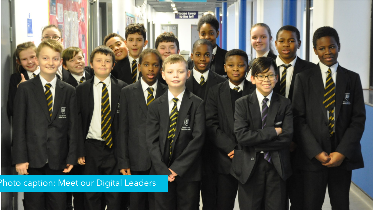
Photo caption: Meet our Digital Leaders